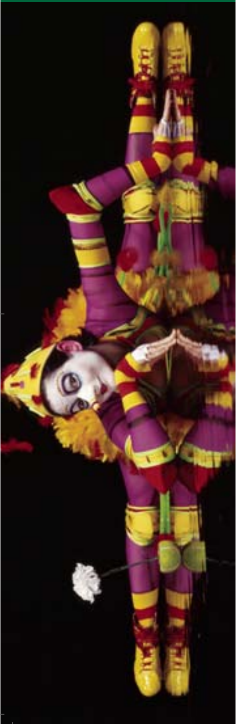
The Green Bird, La Nouba™ by Cirque du Soleil®.